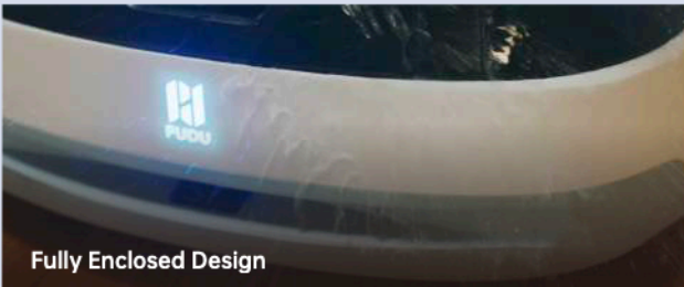
Fully Enclosed Design