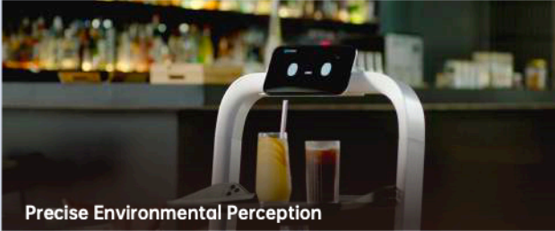
Precise Environmental Perception